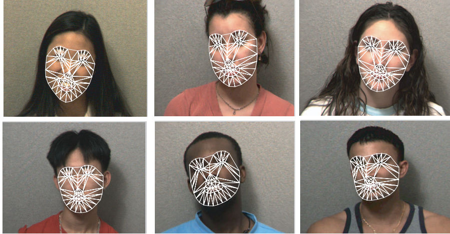
Figure 1: AAM shape registration examples across a number of subjects.

that for ease of presentation we have omitted any mention of the 2D similarity transformation that is used with an AAM to normalize the shape [7]. In this paper we include the normalizing warp in \mathbf{W}(\mathbf{u}; \mathbf{p}) and the similarity normalization parameters in \mathbf{p} . See [9] for the details of how to do this.