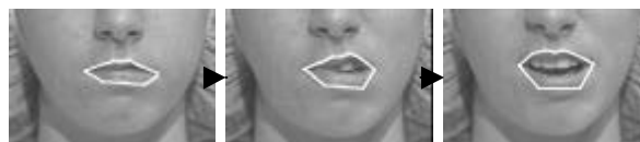
Figure 3. Automated facial feature tracking in image sequence from subject with facial nerve impairment.

Surgical application. Another data source is facial behavior from patients who have experienced damage to the facial nerve or the higher brain centers that control facial behavior [16]. An example can be seen in Figure 3 from [21]. Notice the mild asymmetry in repose due to muscle weakness and the more marked asymmetry that occurs in the second frame. The inclusion of clinical data such as these challenges assumptions of symmetry, which are common when working with directed facial action task images from subjects who have normal facial function.