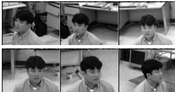
Figure 4. Face images obtained from omniview camera. (6 images are shown here out of 50 that were available).

characteristics, and relation to other non-verbal behavior. Development of robust methods of facial expression analysis requires access to databases that adequately sample from this problem space. The CMU-Pittsburgh AU-Coded Facial Expression Image Database provides a valuable test-bed with which multiple approaches to facial expression analysis may be tested. In current and new work, we will further increase the generalizability of this database.