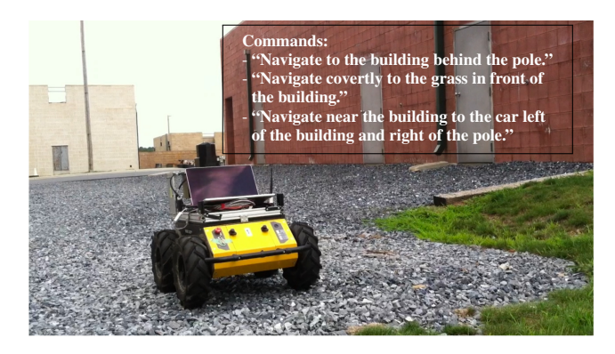
Figure 1: Clearpath<sup>TM</sup> Husky robot used in the experiments

The robot must first recognize the objects in the environment and to label them. We use the semantic perception