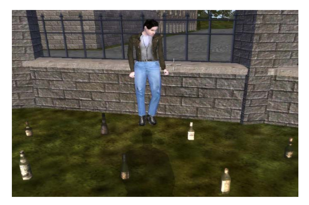
Figure 1: Subject world view during bottle collection. This is a zoomed-in view that has an increased density of bottles for illustrative purposes; the actual 3D environment is much larger and contains a much lower bottle density.

meters. Exploratory benchmarks determined that, depending on search technique and ability, it could take a single OFP civilian virtual character from sixty to ninety minutes to explore all 24 map squares of this scenario. In twenty minutes, a civilian character can thoroughly explore roughly ten map squares of the surrounding countryside. The village of Flers occupies four map squares; part of the village is organized in a radial street plan and another part has a N/S, E/W grid of streets and buildings. Given the area and layout, we have observed that it requires from ten to twenty minutes for the virtual civilian character to search the area.