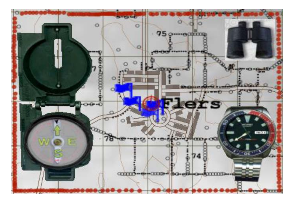
Figure 2: The 2D terrain map available to players in the Operation Flashpoint simulation environment. In addition to the terrain map, the subjects are provided with simulated versions of binoculars, compass, and watch.

computer screens, note sheets or other such aids — they could only describe their locations, intentions and actions in the game by using verbal communications and the 2D OFP map of Flers. All verbal communications, though face-to-face, were logged using TeamSpeak (28).