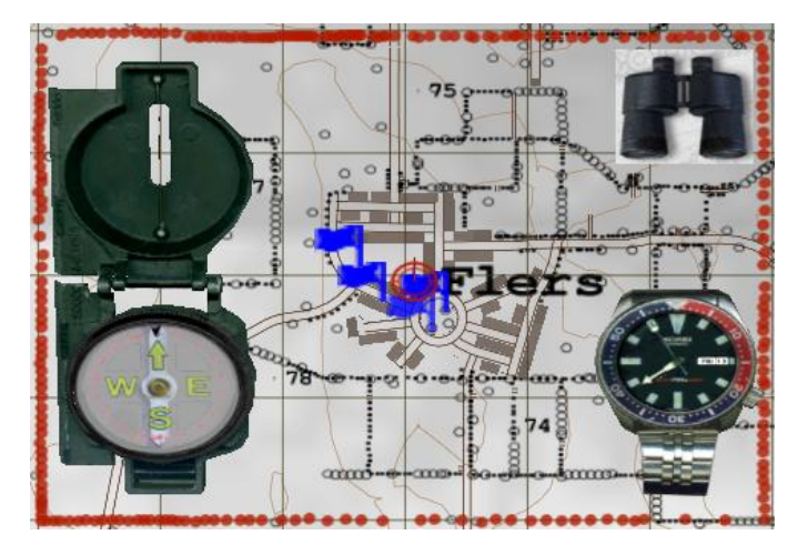
Fig. 2. The 2D terrain map available to players in the Operation Flashpoint simulation environment. In addition to the terrain map, the subjects are provided with simulated versions of binoculars, compass, and watch.

from sixty to ninety minutes to explore all 24 map squares of this scenario. In twenty minutes, a civilian character can thoroughly explore roughly ten map squares of the surrounding countryside. The village of Flers occupies four map squares; part of the village is organized in a radial street plan and another part has a N/S, E/W grid of streets and buildings. Given the area and layout, we have observed that it requires from ten to twenty minutes for the virtual civilian character to search the area.