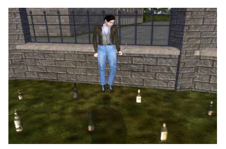
Fig. 1. Subject world view during bottle collection. This is a zoomed-in view that has an increased density of bottles for illustrative purposes; the actual 3D environment is much larger and contains a much lower bottle density.

Terrain around and including the village of Flers on the island of Normandie was chosen as the focal point for the one practice and two experimental scenarios (Figure 2). The area is a tract of land that is 512 meters long in a north–south direction (N/S), and 768 meters long in an east–west direction (E/W); in all, 393,216 square meters. On the 2-dimensional (2D) Operation Flashpoint map, this area corresponds to 4 map squares N/S, 6 map squares E/W, where each map square corresponds to 128 meters by 128 meters. Exploratory benchmarks determined that, depending on search technique and ability, it could take a single OFP civilian virtual character