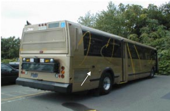
Figure 1 Transit bus with rear-looking and side collision warning systems (small black box, indicated by the arrow).

In the summer of 1998, we did a small study to understand the applicability of these technologies in a transit context. We installed both rear-looking and commercial side-looking CWS on a PAT transit bus (Figure 1). As a demonstration, the systems were very successful. The rear-looking system illustrated the potential for detecting cars approaching from the rear; it was connected to a variable message sign on the back of the bus warning the driver to "slow down!", followed by an air horn for truly inattentive drivers. The side-looking system used 4 sonars along the side of the bus to detect pedestrians and to warn the driver. The demonstration was well received, and led to the full-scale research projects now under way.