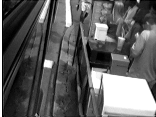
Figure 2 Operating environment of a transit bus. The picture is taken from the top rear right corner of the bus, looking down along the side of the bus, which is visible in the left part of the image. The bus has just left a bus stop and is only one foot away from the curb. Two to three feet away are people and objects.

bus driver knew that the bus would be operating close to pedestrians at a bus stop, the alarm would go off, disturbing the driver and potentially alarming passengers. Figure 2 shows how much "clutter", people as well as objects, can be found very close to the bus.